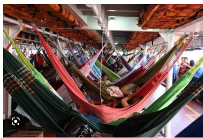
Our sleeping area on the boat