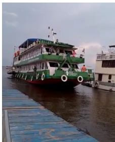
Our boat ride!